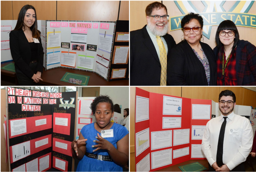
WSU Student Center Building Second floor

“In and Out: From Student to Dental Professional” Camila Rodriguez