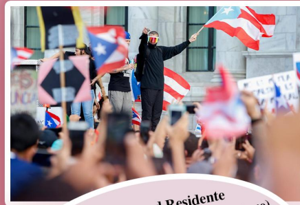
Bad Bunny and Residente (and Ricky Martin not shown in picture) at Protest in Old San Juan, Puerto Rico joining thousands of protesters against Ricardo Rossello, the Governor of Puerto Rico in front of the Capitol Building on July 17, 2019.

Bad Bunny is one of the many Latinx artists that represent and speaks openly about social issues. Along with his rise, the rise of Latin Music, and the rise of new social media platforms such as TikTok, which has amassed over 800 million monthly users. Is paving the way for others to shine light on social issues.