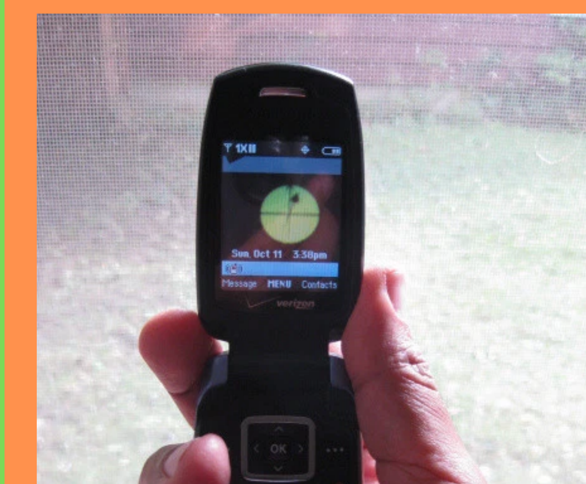
Provided by the Electronic Disturbance Theater