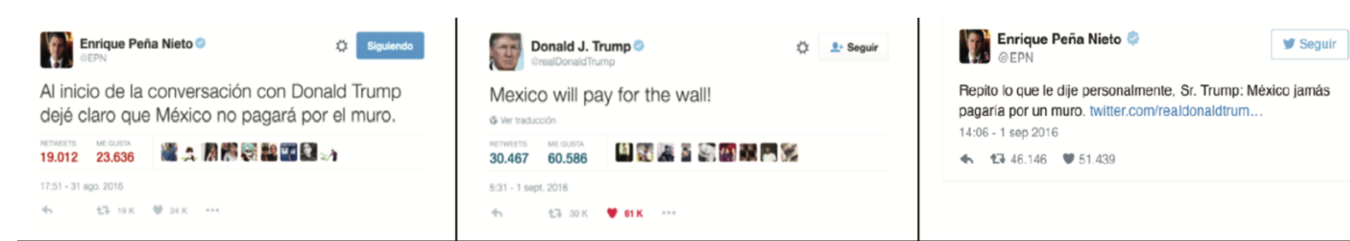
Figure 2. The discursive dispute over the border wall.

The social media impact of the topic in Spanish and English when it was presented during the Trump campaign 2016 about Mexico paying for the wall.