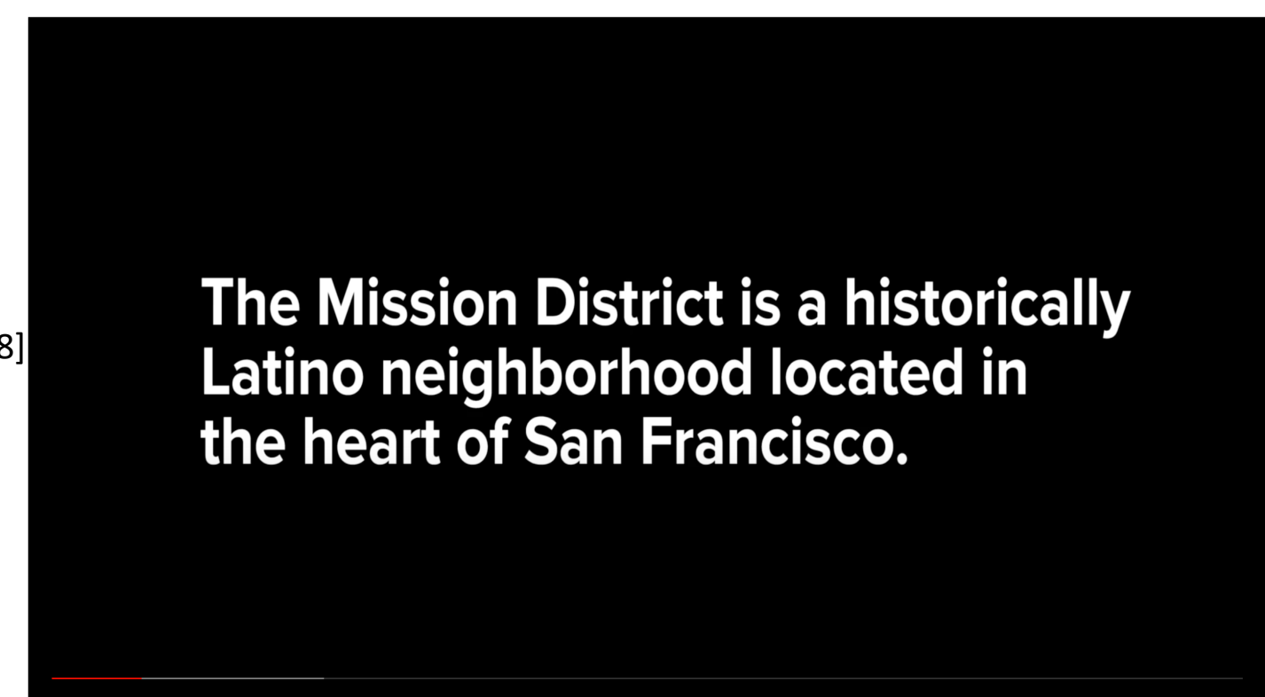
HOW DO YOU VIEW GENTRIFICATION IN COMMUNITIES?