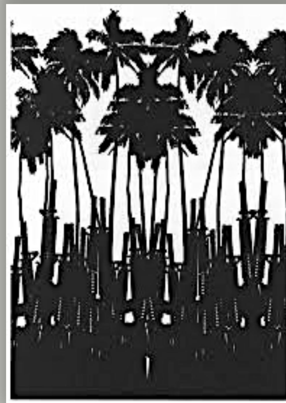
Juan Obando Drug Lord Cartel (Colombia) (2010)