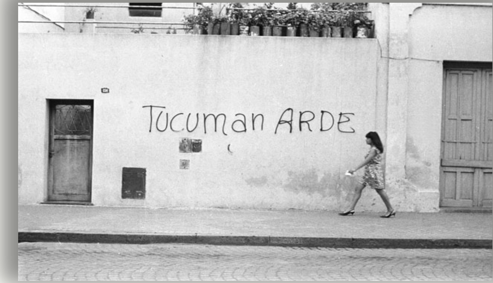
Tucuman Arde, publicity campaign, Rosario, Argentina 1968. Tucuman Arde arose during a time of military control in Argentina. The artists during this time were courageous to stand up against the repression and socioeconomic inequality.