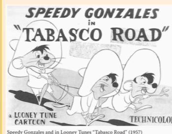
Speedy Gonzales and in Looney Tunes "Tabasco Road" (1957)

Hollywood's strategy to show 'representation' of Latinx cultural identities fails because of lazy roleplaying with stereotypes and false lifestyles.