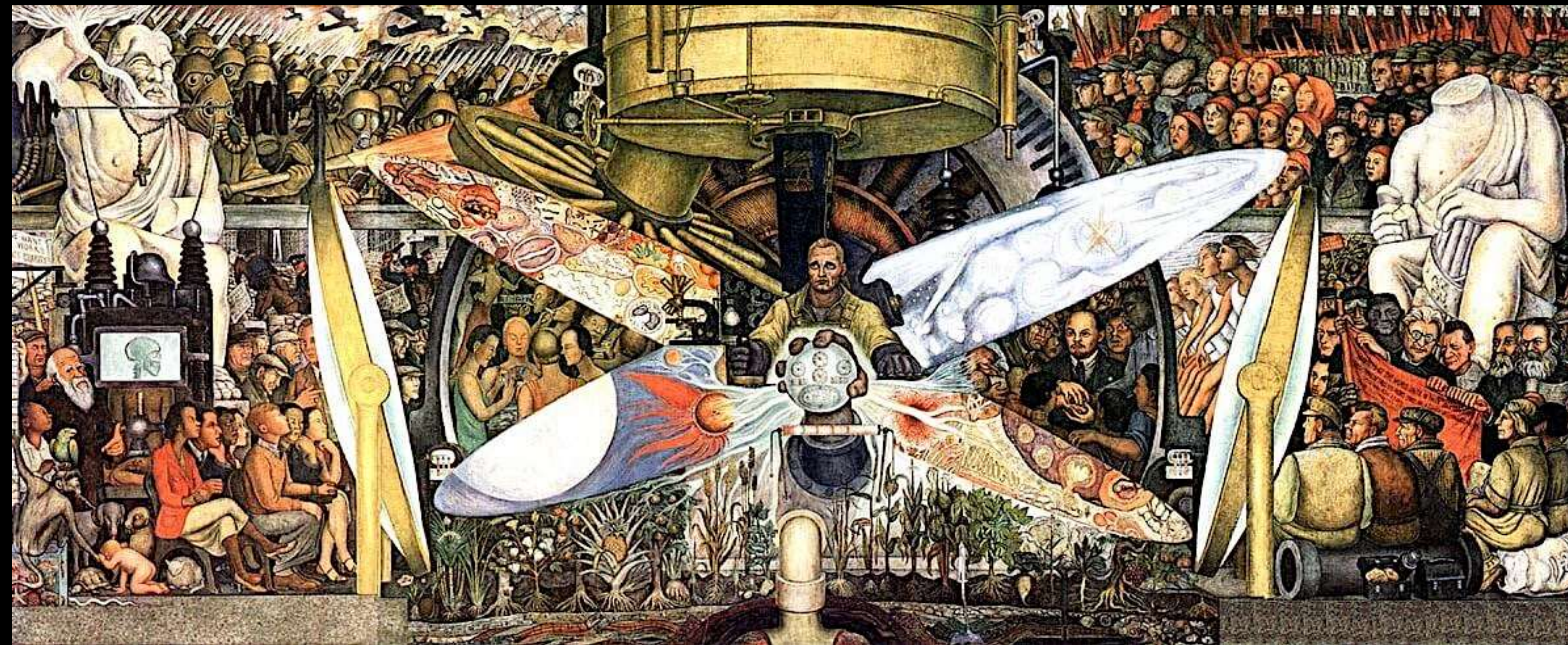
“Man at the Crossroads” (1934)