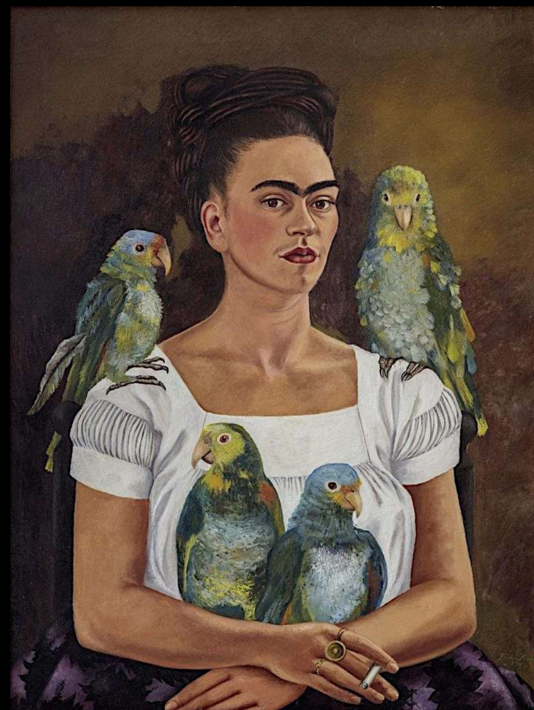
“Me and My Parrots” (1941)