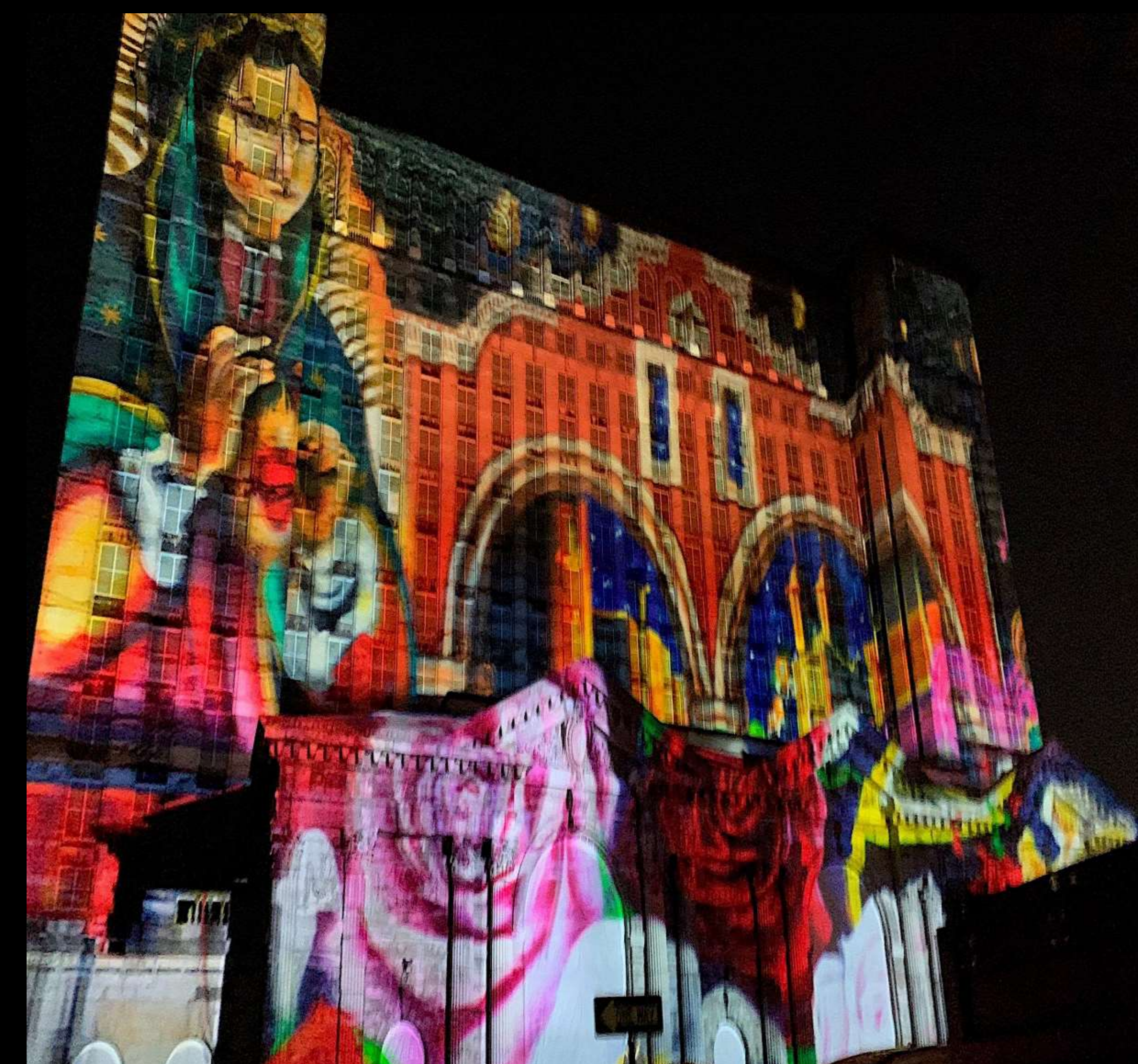
Mural digitally displayed on the Detroit Train Station (2019)