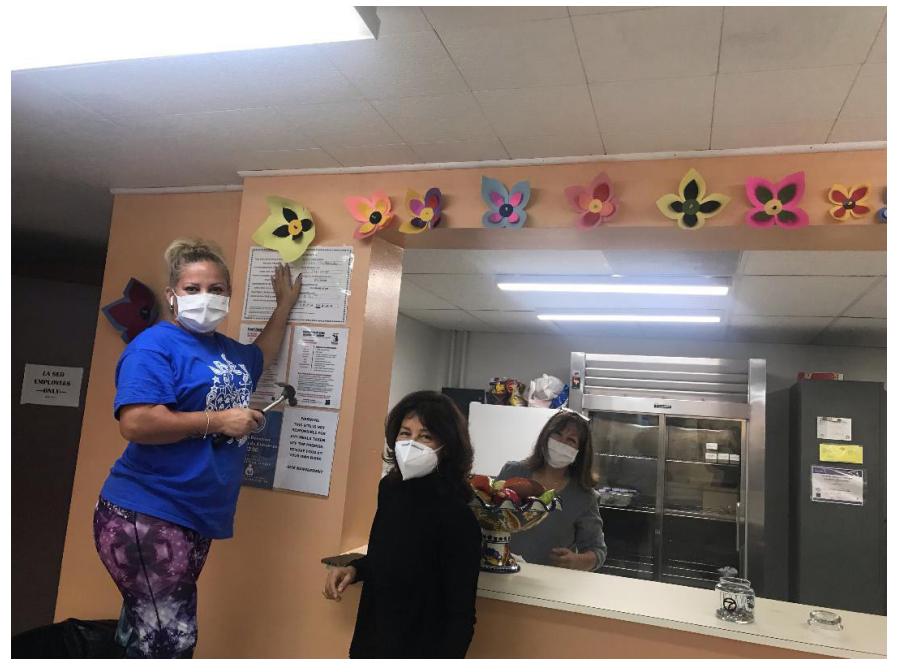
Seniors in Mexicantown Southwest Detroit prepare their center (LASED senior center) with handmade festive decorations to celebrate Hispanic Heritage Month.